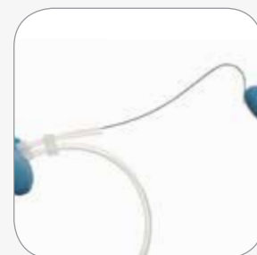
Various guidewire options