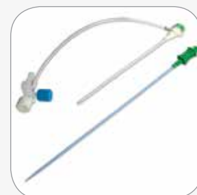
Various sheath options